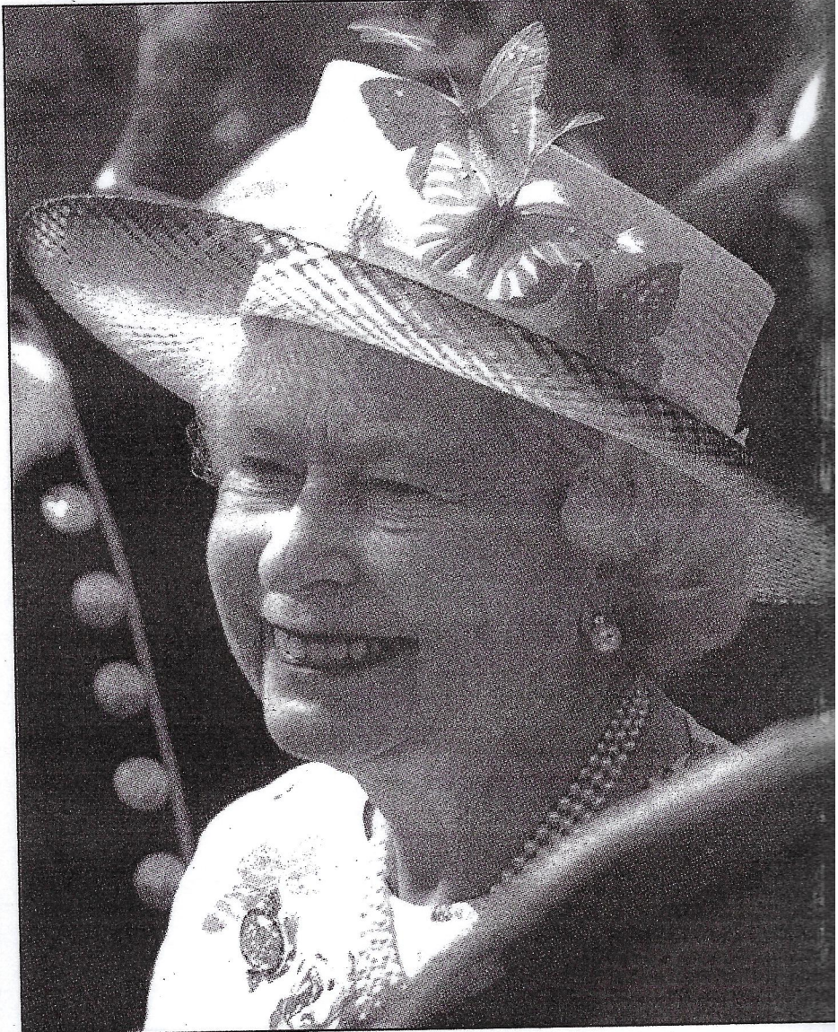
QUEEN: Enjoyed visiting the Pepper Pot Centre in West London

If you want to be part of this centre and the joy that they bring all year long then their address and contact details are below. I would like to take the time to congratulate the Pepper Pot Day Centre for all their hard work and here at the Caribbean Times Newspaper we wish you all the best of luck in the forthcoming future.